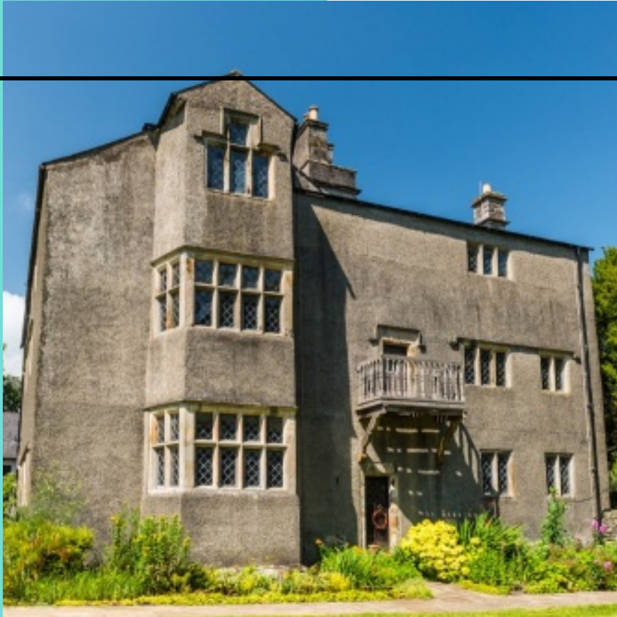
17th Century Private Country Hall & Grounds