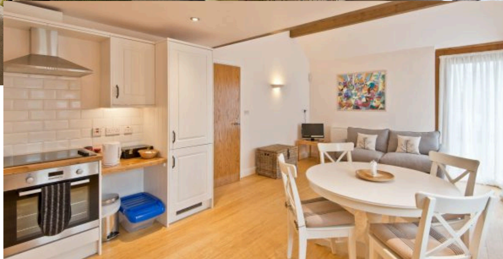
Private accommodation with shared kitchen facilities and comfortable communal lounges.